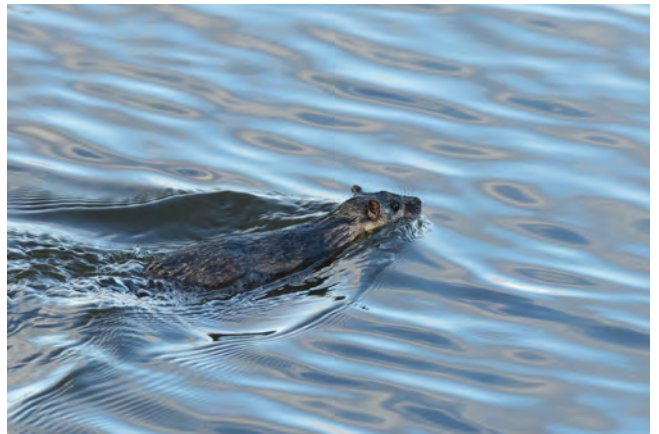
Rakali or Water Rat