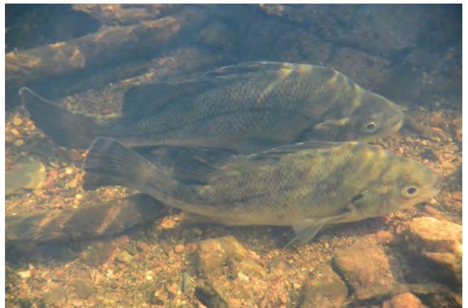
Threatened Macquarie Perch (Luke Pearce)