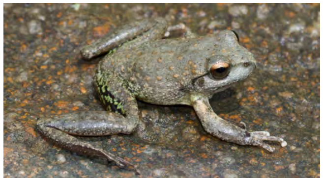
Threatened Booroolong Frog (Dan Florance)