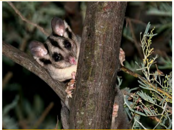
Threatened Squirrel Glider (Katherine Tuft)