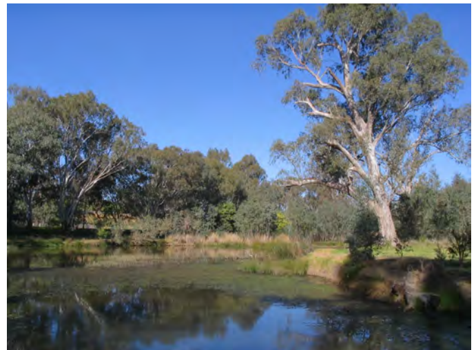
Wonga wetland, NSW