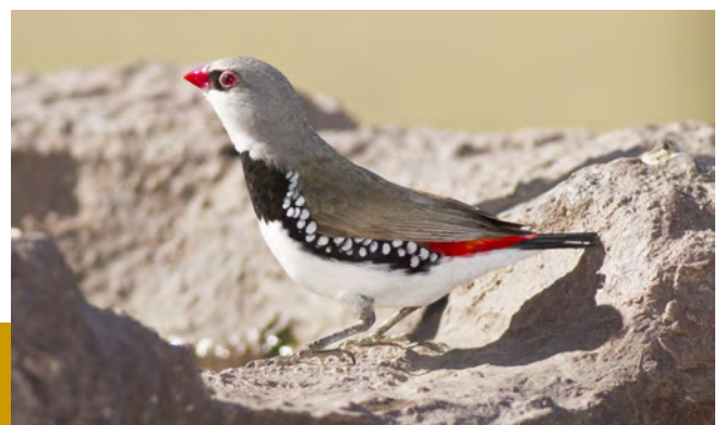
Southern Bell Frog, Grey Teals, and Diamond Firetail

Additional habitat, such as trees, shrubs and tall grass around the dam, can also benefit many terrestrial species. One of these is the threatened Diamond Firetail, which prefers to breed near water points.