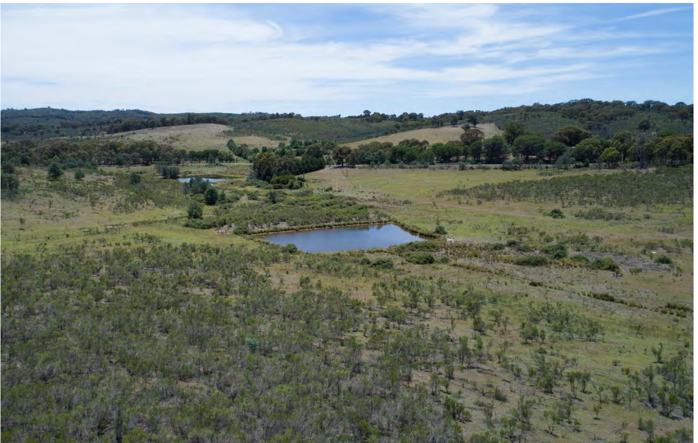
Farm dams at Boorowa, NSW

While natural wetlands are now in short supply, thousands of farm dams dot the landscape and, with appropriate management, can help restore biodiversity by providing much needed wetland habitats for native wildlife.